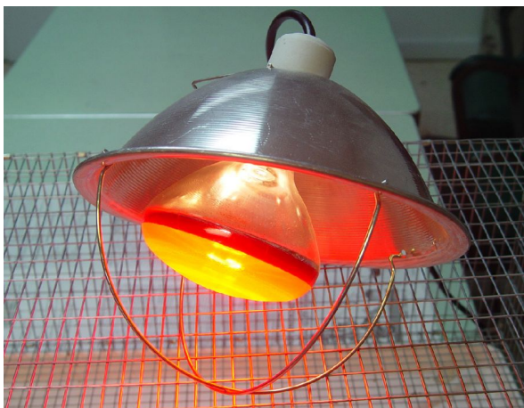
Figure 2. Heat lamp

week until they are four weeks old. In other words, one week old chicks can tolerate 90 degrees F and two week old chicks can tolerate 85 degrees F. The easiest way to heat a homemade brooder is with a light bulb or heat lamp (see figure 2). Suspend the heat source over the middle of the brooder. Observe the chick' behavior to get the brooder temperature right: they will huddle up in the middle directly under the heat source if the brooder is too cold and move to the edge of the brooder away from the heat source if it is too hot. When the brooder is at a comfortable temperature, the chicks will move about freely throughout the available space.