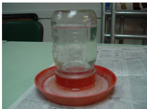
Figure 3. Chick water fountain

Chicks can survive up to two or three days without eating or drinking right after hatching because they are able to utilize the nutrients remaining in their retained yolk sac during this time. This is how hatcheries can ship chicks all over the country with little or no mortality. When chicks arrive, they will be thirsty. It is extremely important to make sure each chick gets a good drink of water upon arrival. Water should be available to chicks at all times. It is optional to add 1/4 to 1/2 cup of sugar to one gallon of water to give chicks upon arrival to boost the chicks energy level if they appear lethargic. Also one teaspoon of antibiotic powder specially labeled for chicks and available at most feed stores can be added to water if the chicks appear unthrifty upon arrival. As chicks are removed from the shipping box, dip their beaks in the water to encourage them to drink (see figure 3).