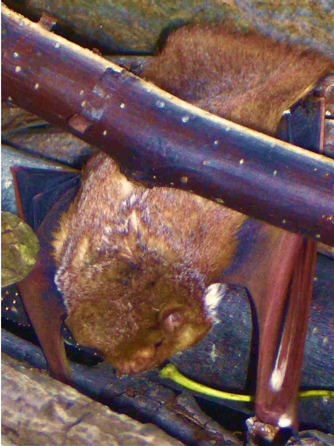
Figure 1. Bats are voracious consumers of insects that may help reduce local populations of some insect pests.

Bats consume insects that are major pests of agricultural crops. Several species that occur in